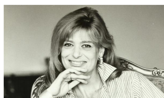
Melina Mercouri in London