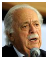
George Bizos SC (RSA) Human Rights Advocate & Author, founder of the South African Committee